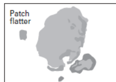
After about two weeks you may see a change in your skin. The scaly or flaky patches usually clear up first. They will feel smoother.