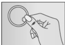
Figure 1 Take NuvaRing out of the sachet