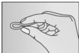
Figure 2 Compress the ring