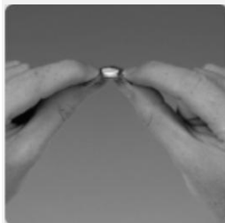
3. Gently push out the Zofran Melt tablet.