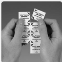
1. Tear off one Zofran Melt in its blister.