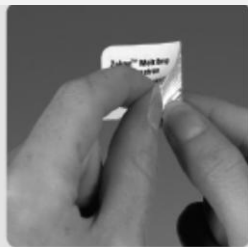
2. Peel back the foil, as shown by the arrow.