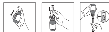
Figure D Figure E Figure F