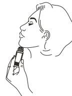
Applying the solution