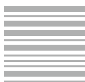
Sertraline 25 mg/ 50 mg/ and 100 mg film-coated tablets 2XXXXX