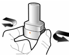
Pierce and release